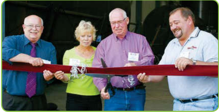
Leading Manufacturing Group Grand Opening